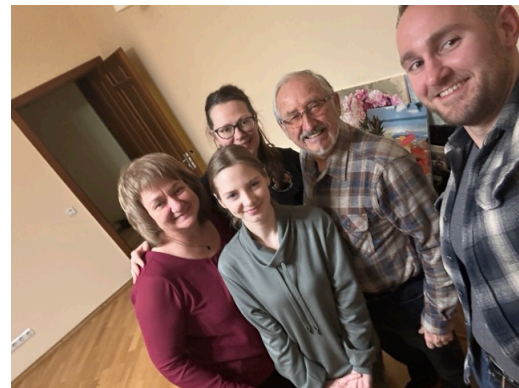
Spending some time with church members