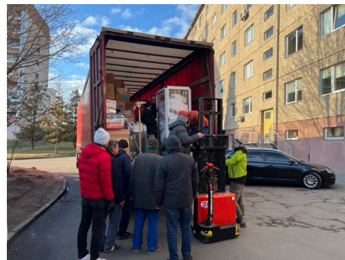
Unloading a container at the hospital