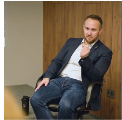
Teaching at King Daniel University.