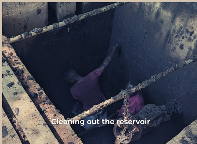
Cleaning out the reservoir

Months and months have passed, but we have finally been able to install the new hydraulic ram pump on the mission. It was a headache (in multiple ways) to finally get the parts here, but we are so grateful all of that is in the past. Once we received the parts on the mission, we immediately started to work on the hydam and clean all of the various components to the system. There is a deep reservoir nearly 12 ft. deep that was completely filled with mud that had to be cleaned out by hand. All of the incoming and outgoing water channels also had to be cleaned from silt, mud, and debris. Thankfully, everything is now in working order. We have a few small things to do still, but the water is pumping great, and our cisterns have stayed completely full - allowing plentiful water to the hospital for sanitation and all the spigots and water accesses throughout the mission. Once again, thanks to all of you who helped get these parts repaired and replaced. We are so extremely grateful.