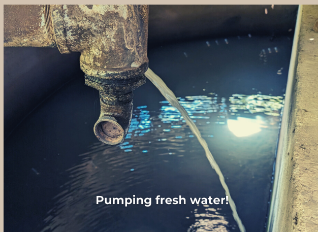
Pumping fresh water!