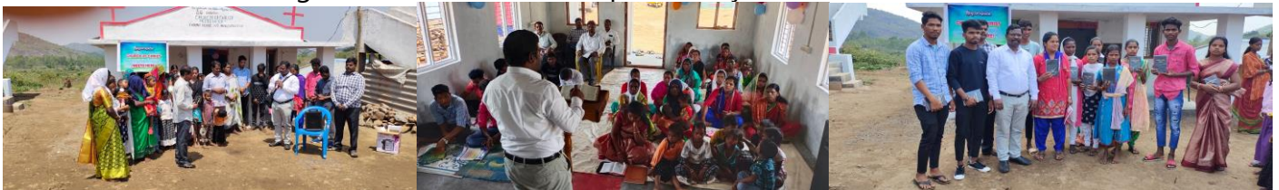
Newly inaugurated church building in Majjivalasa

On Tuesday 27 th , we visited Majjivalasa village in the Aruku area. I was invited to inaugurate the meeting shed and to preach the gospel in the inauguration program. The church Majjivalasa are able to construct the Meeting shed, with the kind help from Wylie church of Christ. Tx.