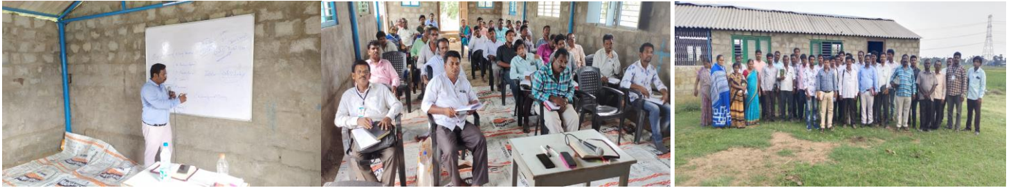
Pictures of Preachers Bible classes in the month of June