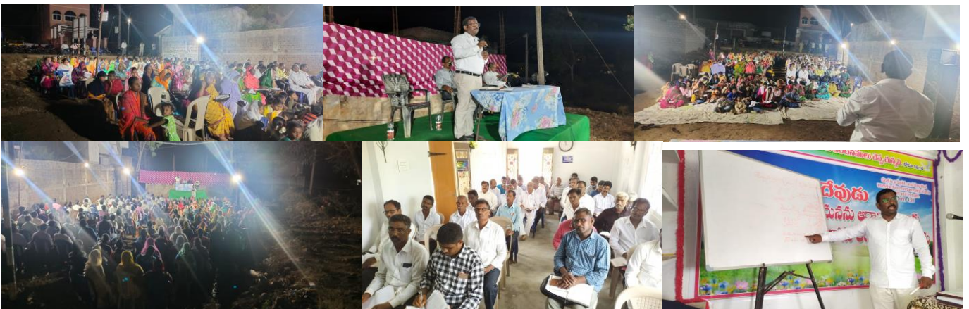
Photographs of Preachers Bible Classes and Night time gospel Meeting in Khambhampadu

Tuesday 3 rd May : The church in Khambhampadu village conducted morning Preachers Bible class and night time gospel meeting. For the preachers Bible class in the morning nearly 45 above preachers are attended for the class. I taught the lessons on the "Importance of the Sound Doctrine –Part-1" and in the night time gospel meeting I preached the lessons on the Salvation from sins possible only through Jesus Christ