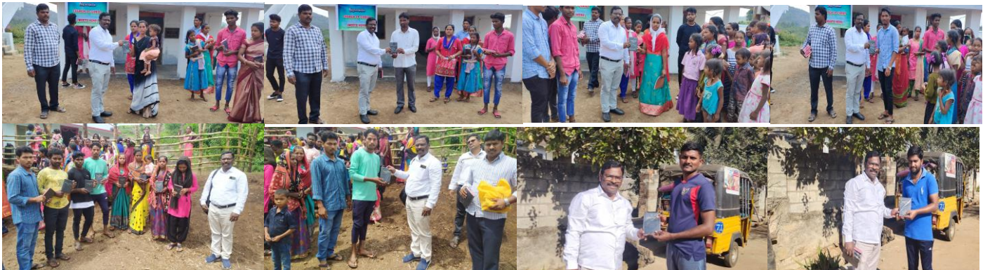
Free Bibles distribution to the newly baptized men and women and to the needy Christians in the remote area villages