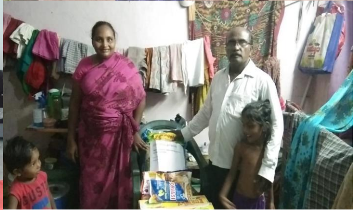
Covid-19 relief work : Distribution of provisions to the poor and needy families