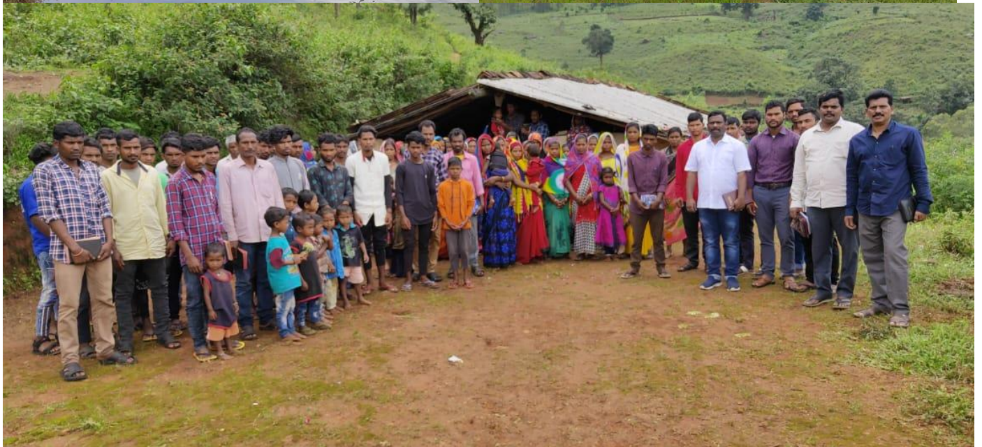
Group photo with the men and women who obeyed to the gospel of Jesus Christ in Buddaputtu village in Paderu area