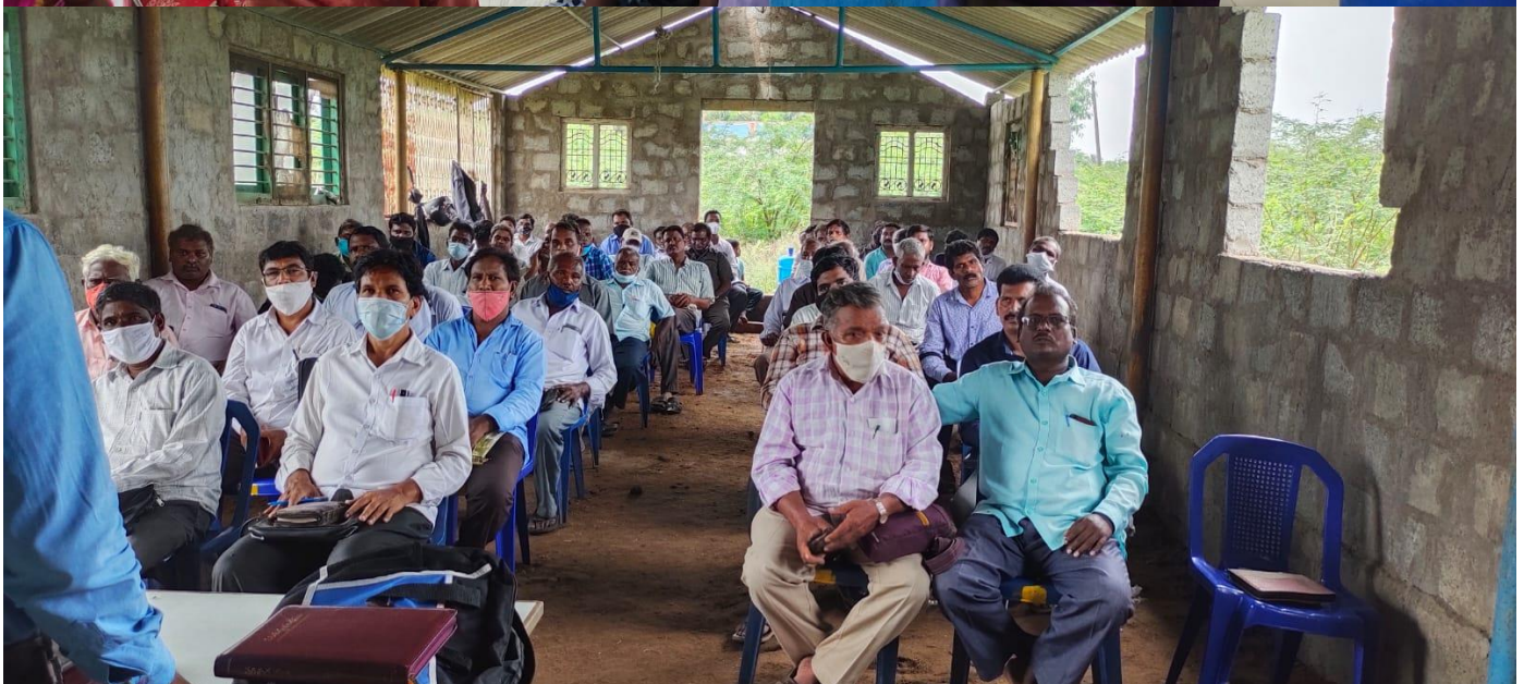
1. Gospel Meeting