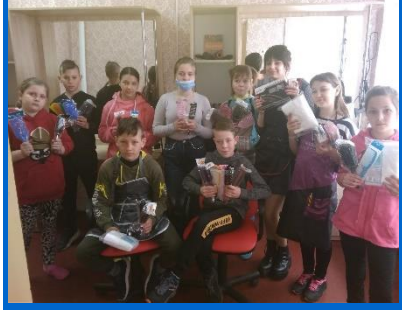
The older children are learning well and progress is amazing.

He is willing to assist us to secure all the needed authorization should we get any such offer in future to help the needy in our country.