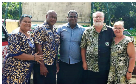
Thank you from the Chief of Tavea Island

With the exception of the two water tanks to be installed, this will finish up our relief efforts to the North. The people were so very grateful for your generosity and have repeatedly asked us to tell you how thankful they are to you for your generous gifts in their time of trouble. May God richly repay your kindness!