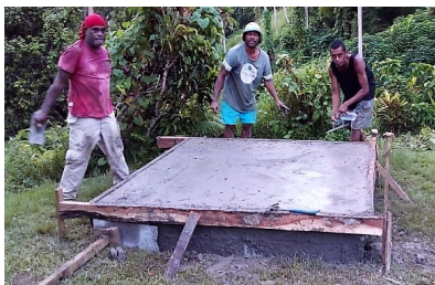
Foundation laid for 5000 liter water tank

The brethren were uplifted and very encouraged by the workshop and were already planning for next year's event.