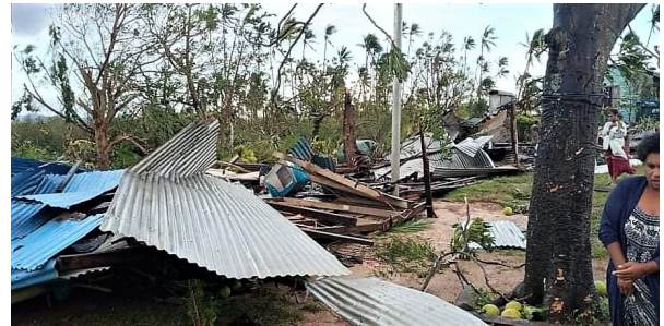
Destruction from Cyclone Yasa