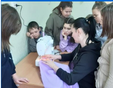
Seamstress/Sewing training in the Svitlovodsk Tuberculosis Orphanage