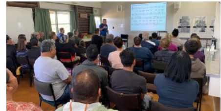
South Auckland camp