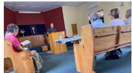
Speaking for the Nelson church

I have begun teaching another 10-week series for the Make Disciples Training Program. This time, I have 14 students. Reminder: One time when I had 13 students, they set 42 Bible studies in 10 weeks. Let's see how these students do. The Lord will be with them, and I am sure they will do well to God's glory.