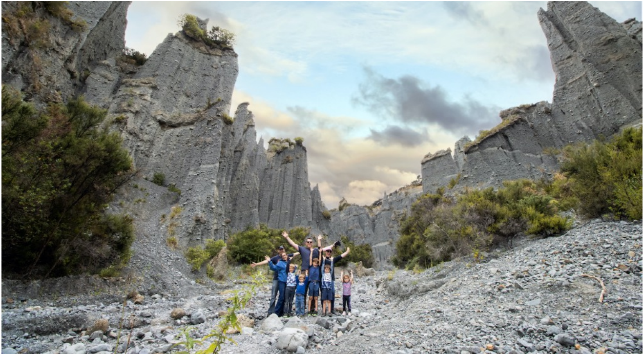
Hike at the Putangirua Pinnacles

— taking the soul-saving gospel to a lost and dying world —