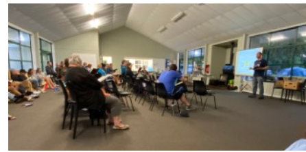
Speaking at the Palmerston North church camp

Our weekly Bible studies have started to resume now that we've returned from our trips. We are also hosting a fortnightly viewing and discussion of The Chosen , a TV series based on the life of Christ.