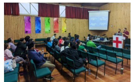
Preaching for the Zomi Christian Fellowship