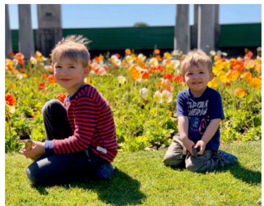
The Boys in Napier

We have three other weekly and fortnightly studies going at this time.