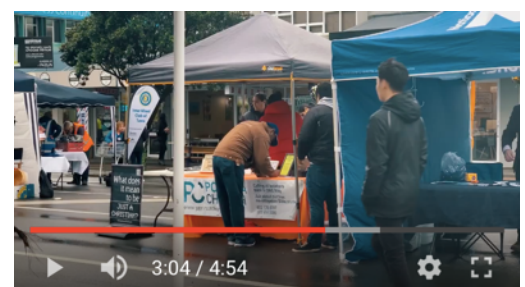
Spring into Tawa Video. Click here.