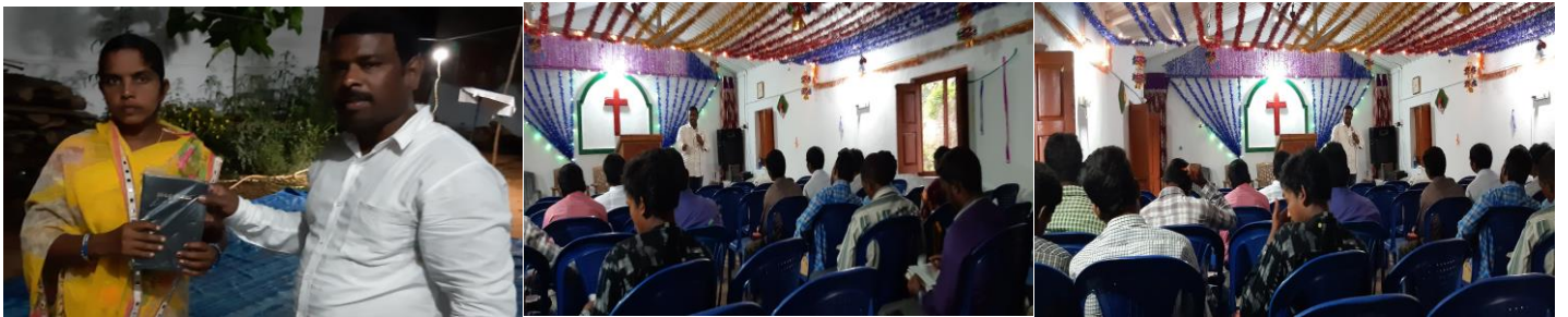
Photographs of Free bibles distribution and Bible class with denominational preachers