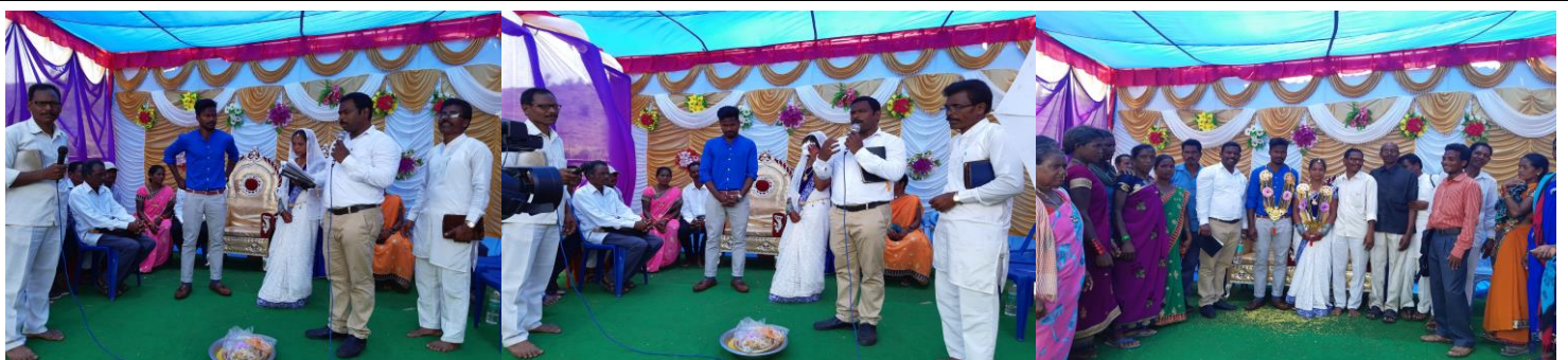
Conducted the Wedding Cermoney one of the tribal village in Aruku area