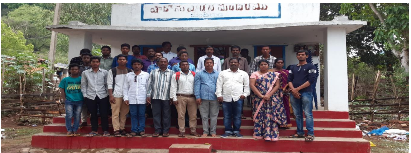
Group photograph with the denominational preachers who attended for the bible class in Dumbriguda village