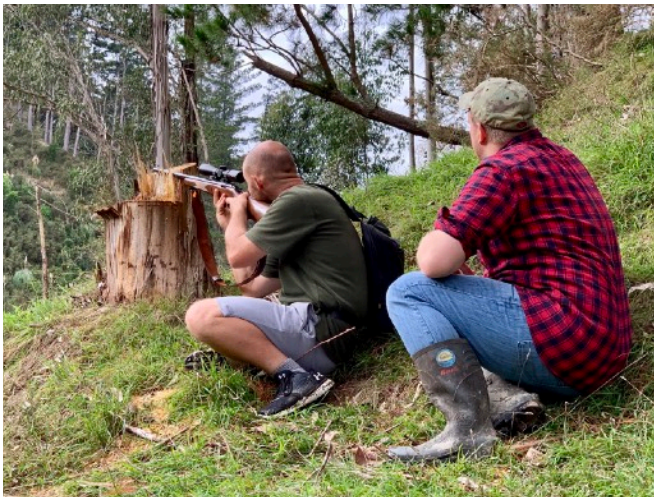
Men's hunting trip