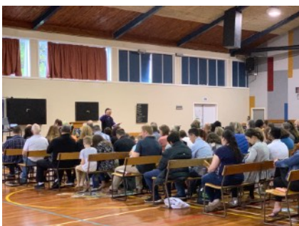
New Plymouth camp